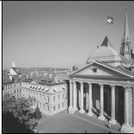
St. Pierre's Cathedral and the Calvin Musuem in Geneva.

Our tour begins in France, the country of Calvin's birth. Starting off with a three-night stay in the magnificent French capital, Paris, we'll have opportunities to get acquainted with some of the city's historic churches and world-class museums. We'll also make excursions to Noyon, the little town where Calvin was born; the amaz-ing Chateau deVersailles; and Orleans, the scenic city where Calvin studied law. Then, we'll head for Reims to see its wonderful old cathedral, and we'll spend a night in Strasbourg. Calvin was exiled here from 1538 to 1541, during which time he pastored a congregation of French refugees.